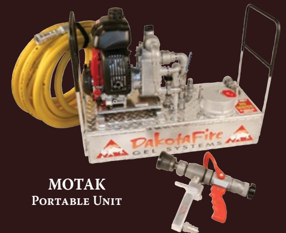
MOTAK PORTABLE UNIT