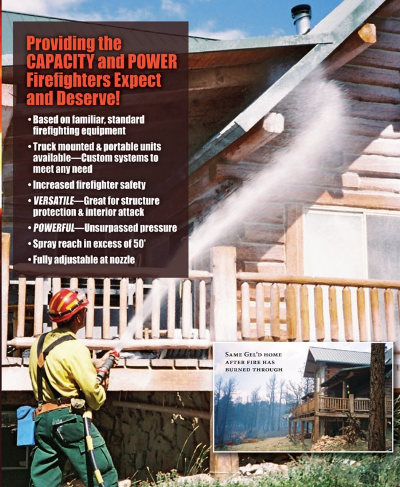
SAME GEL'D HOME AFTER FIRE HAS BURNED THROUGH